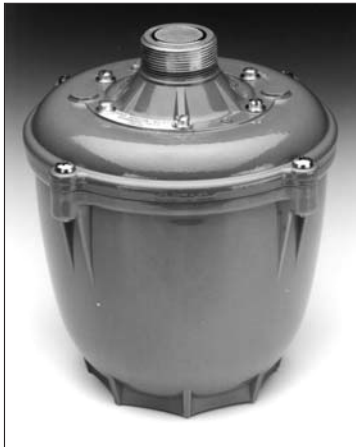
PD-60A / PD-60AT